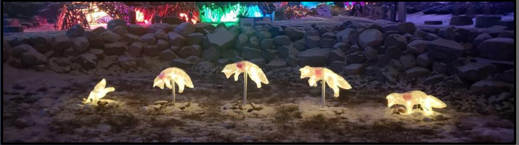
“Winter Hunt” sculpture at Flying Canoe Festival, 2020, by Gabrielle Lamontagne